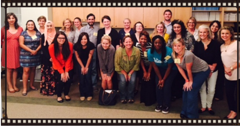
On September 21, Bo's Place welcomed 29 new volunteers when the fall Bo's Place Volunteer Facilitator Training concluded!