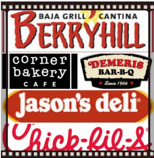
Big thanks to our generous food donors for our August/September Volunteer Facilitator Training program. Our new volunteers enjoyed your delicious contributions!