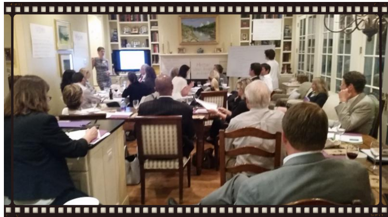
On September 22, the Bo's Place board of directors gathered for the annual Board Retreat to assess progress and develop new goals and strategies for the next five years.