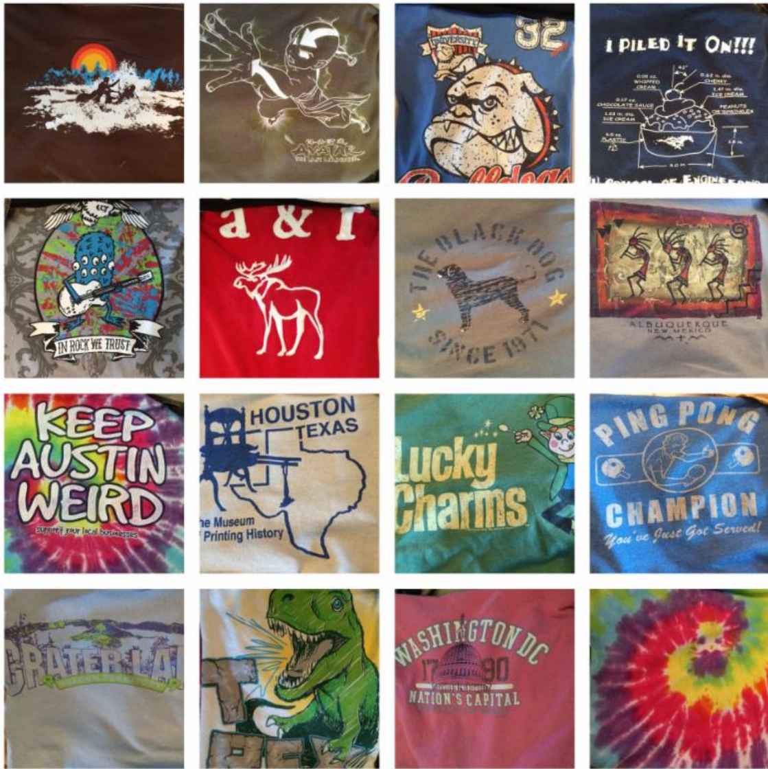
Repurposed clothing from Amie's family turned into messenger bags