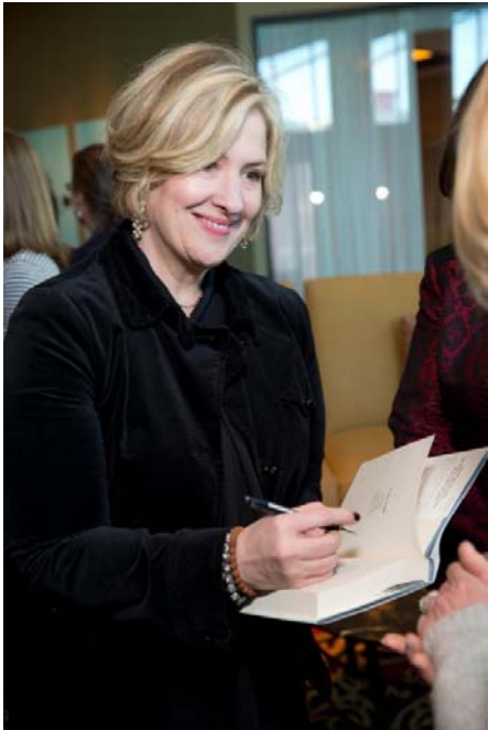
Dr. Brené Brown